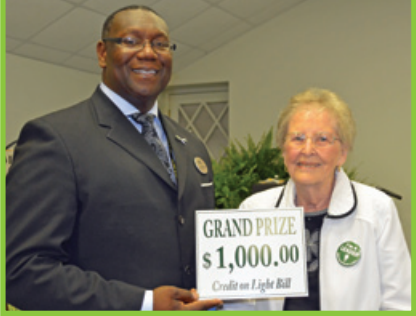
Join us for a fun filled day! Lots of gifts awarded, including the Grand Prize, $1000 credit on your Mitchell EMC account.

As a Member-Owner YOU have the power to make a difference!